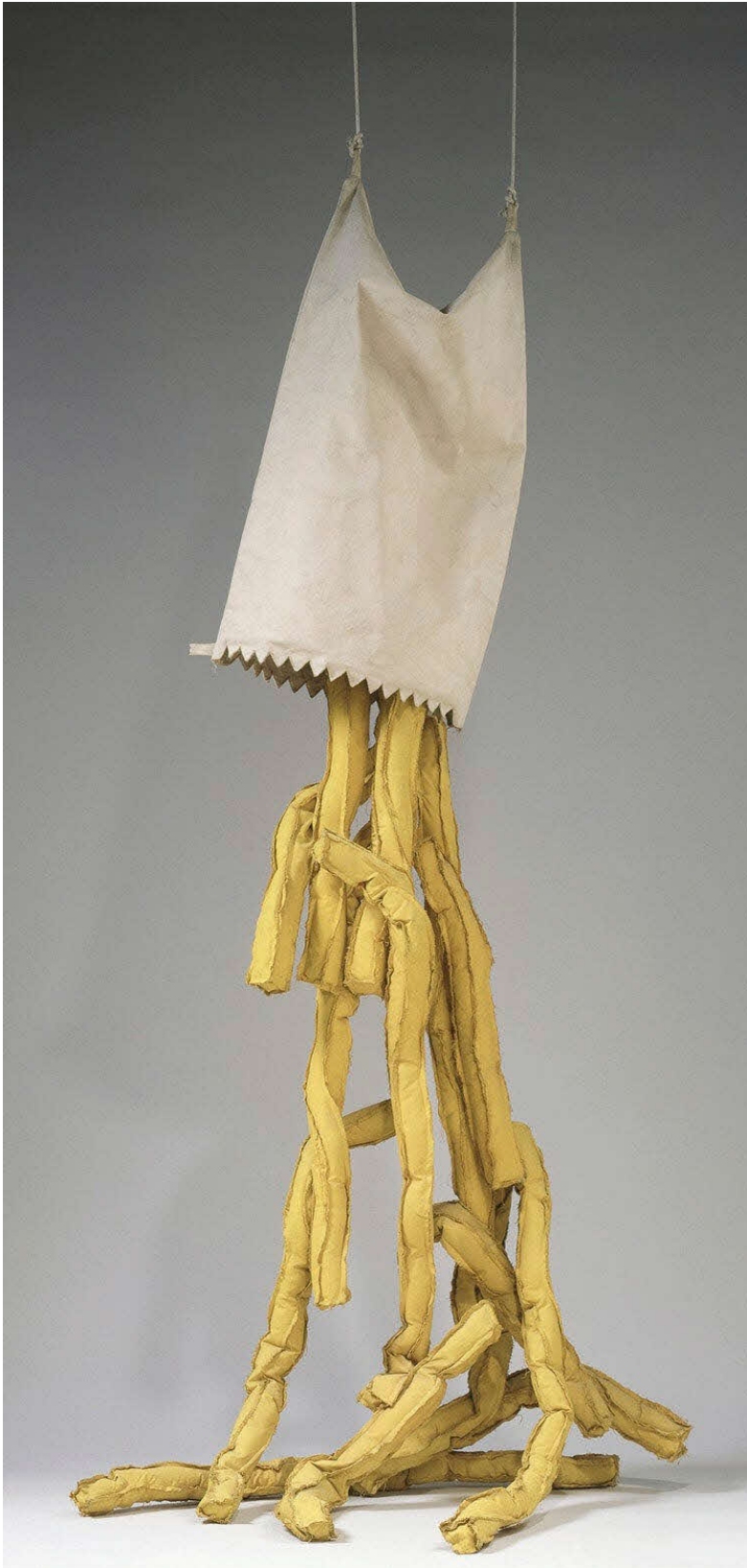
Claes Oldenburg, Shoestring Potatoes Spilling from a Bag 1966 Canvas, kapok, glue, acrylic, 274 × 117 × 107 cm variable